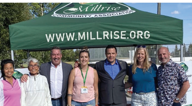
Always great to attend our community association events and meetings