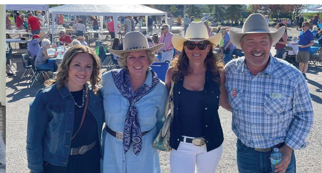
Thanks to the 2500 who came out to our Ward 13 Stampede Breakfast