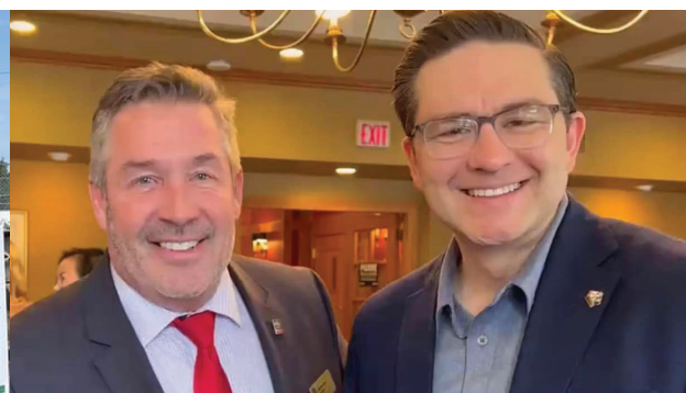
Advocating for our City with our provincial and federal leaders