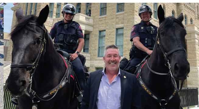
Thank you to all those in law enforcement for keeping us safe