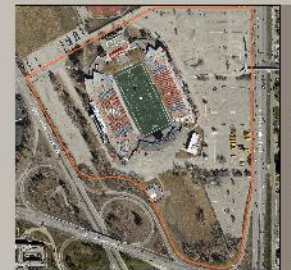
McMahon Stadium 1960