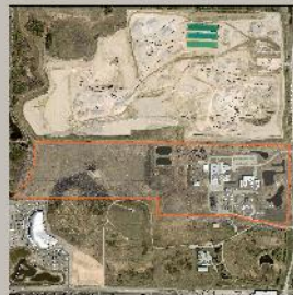
Sky Hill Campus 1950