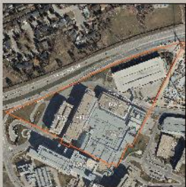
Faculty Campus 1980