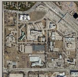
Research Park 1980