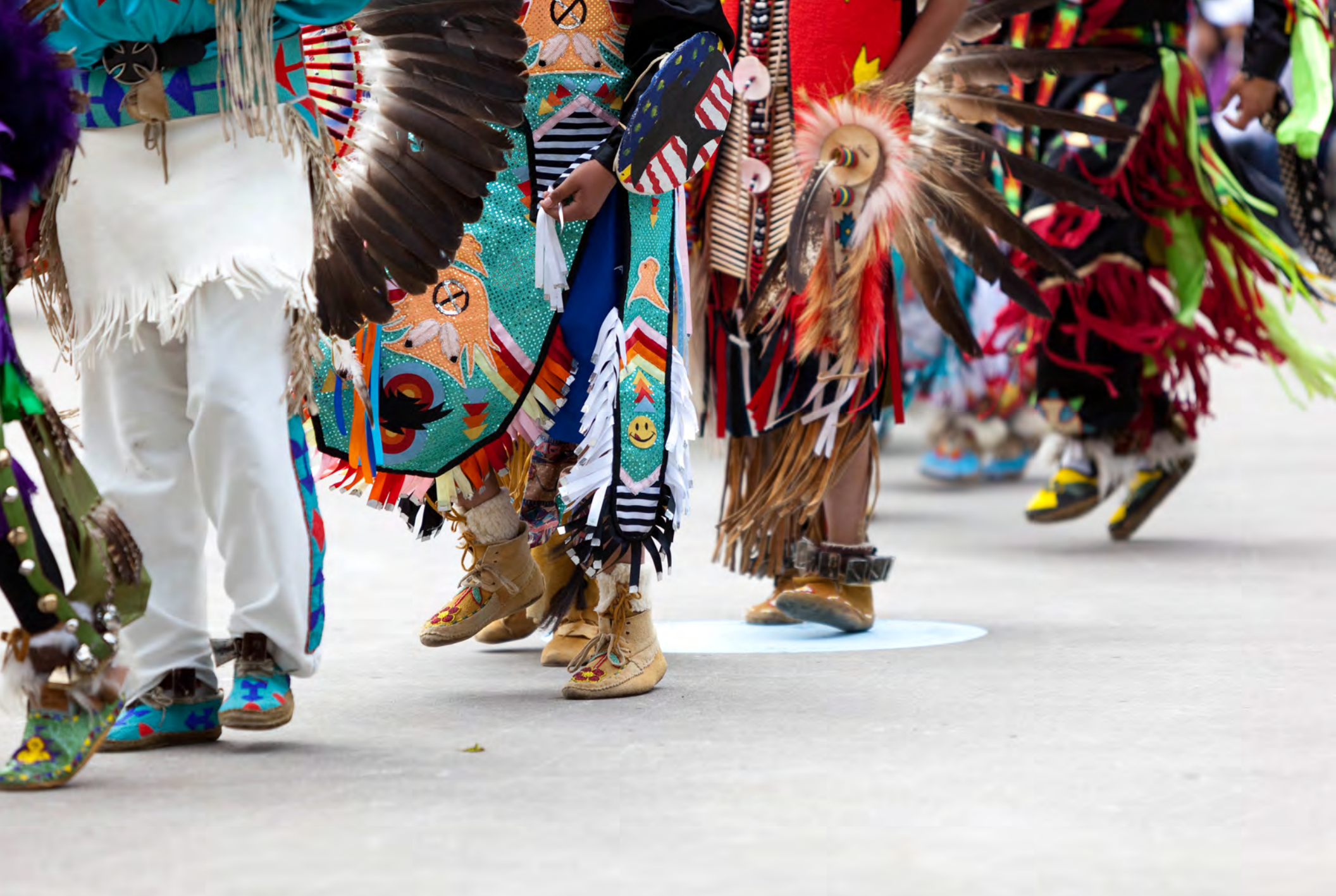
First Nations Parade at Calgary Stampede Rope Square

Calgary joins a group of leading cities in recognizing the role of culture as a central force in shaping the growth of more livable cities.