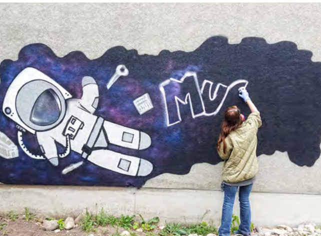
Learning street art skills - Painted City Street Art Program for Youth