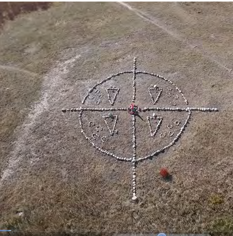
Medicine wheel at Nose Hill Park