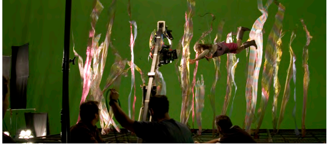
Stop motion for Tideland movie from Bleeding Art Industries