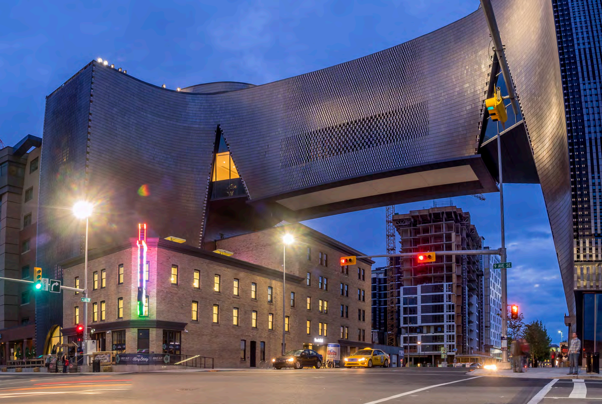
Studio Bell, Home of the National Music Centre

It's time to seize our cultural momentum, to fully commit to a culturally dynamic city.