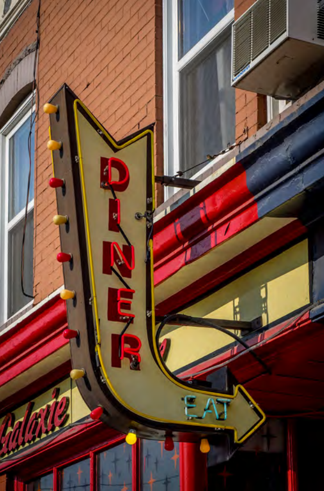
Galaxie Diner in the historic 1912 Brighden Block