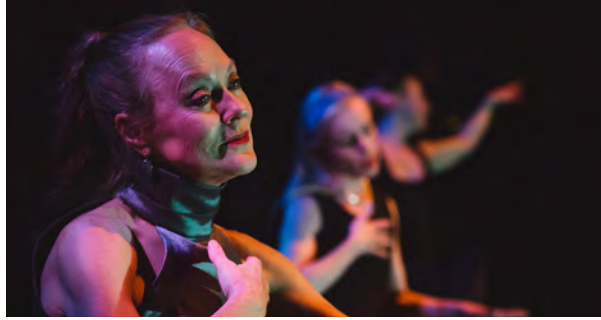
Calgary I Love You, But You're Killing Me by One Yellow Rabbit