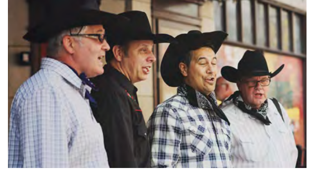
Barbershop quartet during Calgary Stampede