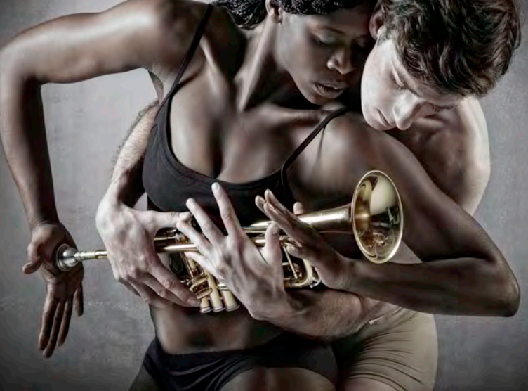
Decidedly Jazz Danceworks