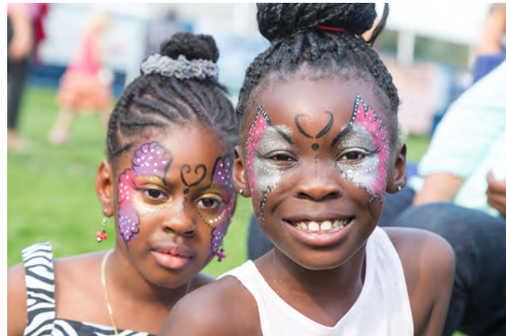
Face painting at Expo Latino