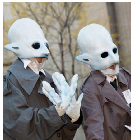
Green Fools Theatre at Culture Days