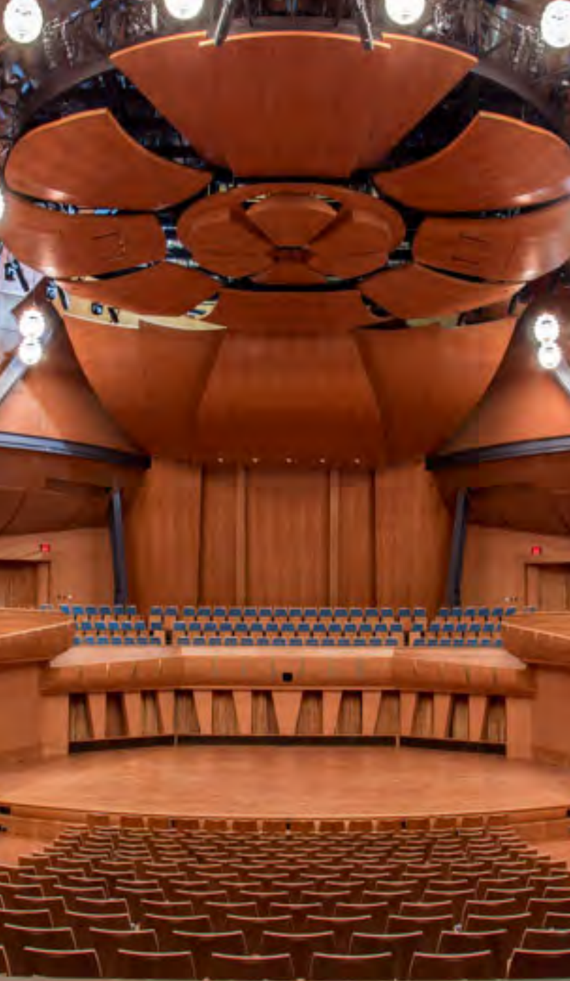
Taylor Centre for the Performing Arts, Mount Royal University