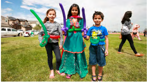
Sherwood BBQ and Multicultural Festival