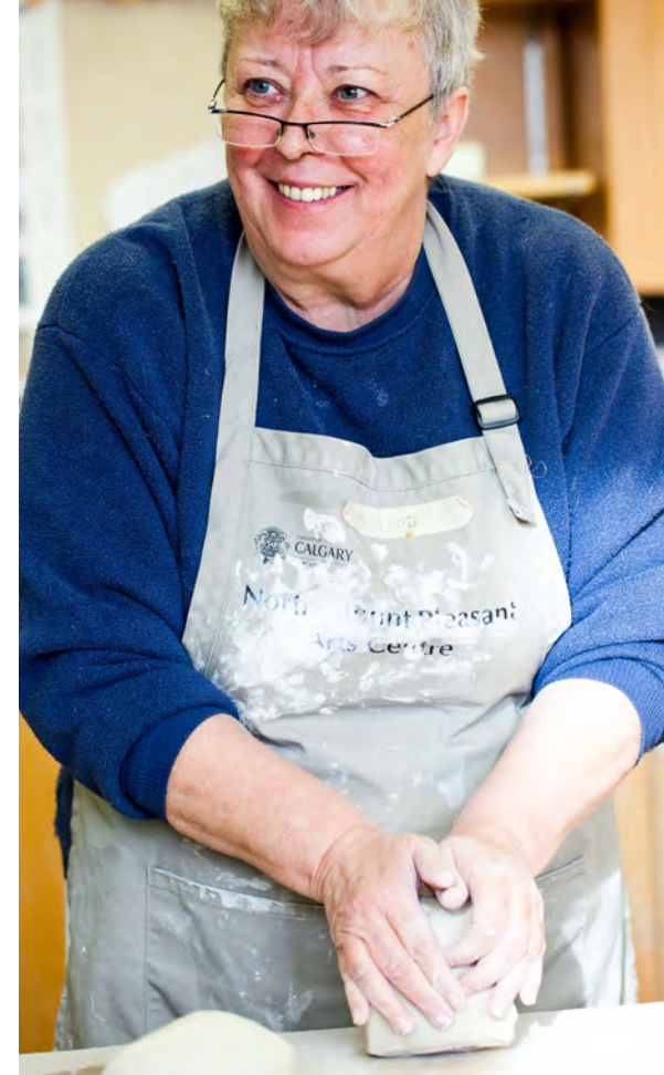
Starting a pot at North Mount Pleasant Arts Centre