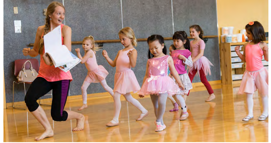
Dance class at Wildflower Arts Centre