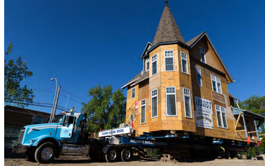
Moving the historic McHugh house