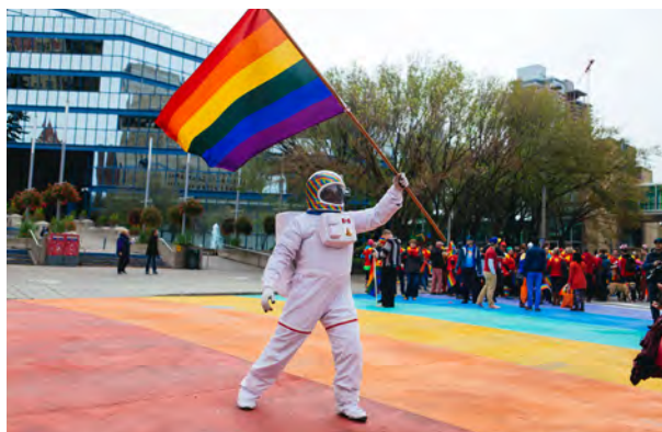
Pride Parade has landed