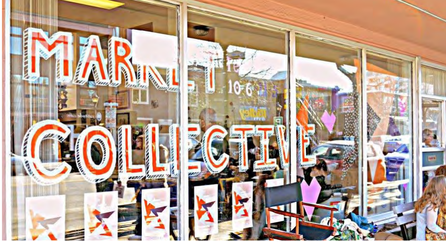
Market Collective early days