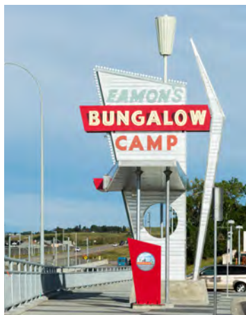
1950s Eamon's Bungalow Camp sign at Tuscany LRT station

Following are the Strategic Priorities and their visions for 2026, followed by Actions for each priority through the next City of Calgary business cycle.