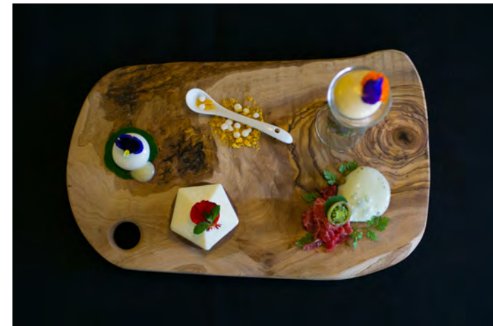
Engineered Eats at Beakerhead by The Fine Diner