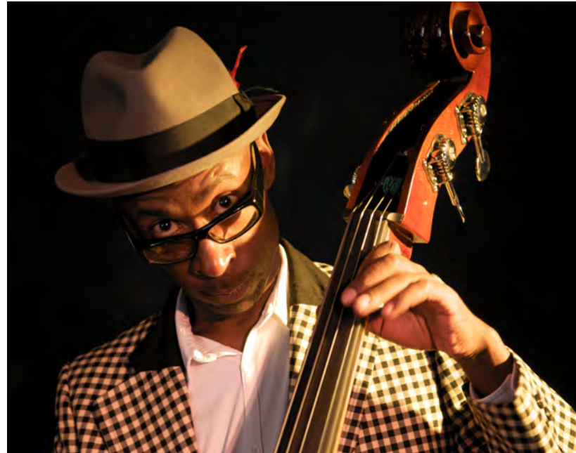
Calgary musician slaps the bass