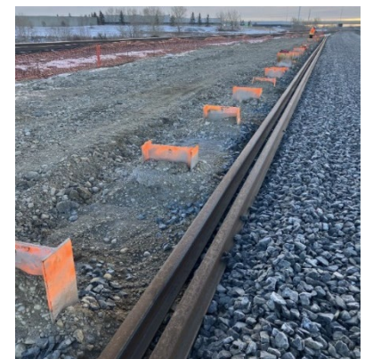
CPKC Diversion track being prepared at 78 Avenue Project site.