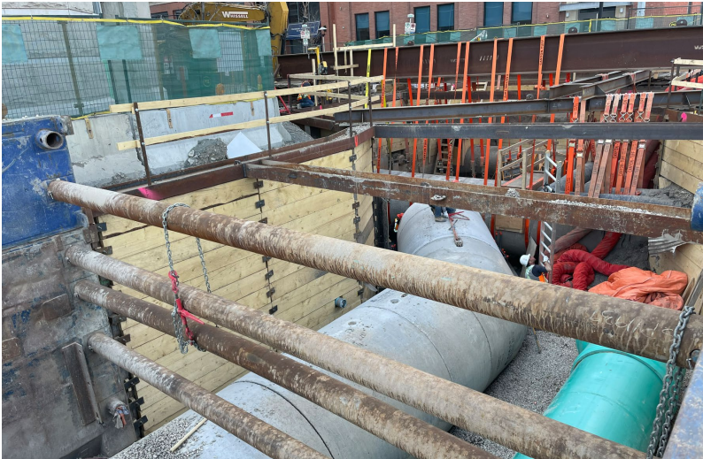
Looking north at deep utility relocation work in Olympic Way S.E., north of 11 Avenue S.E.