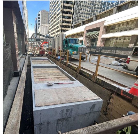
Looking west at Enmax vault installation at 2 Street S.W. and 5 Avenue S.W.

The following utility relocation work in the Beltline and Downtown continued during April with a look ahead at planned construction activity for the month of May: