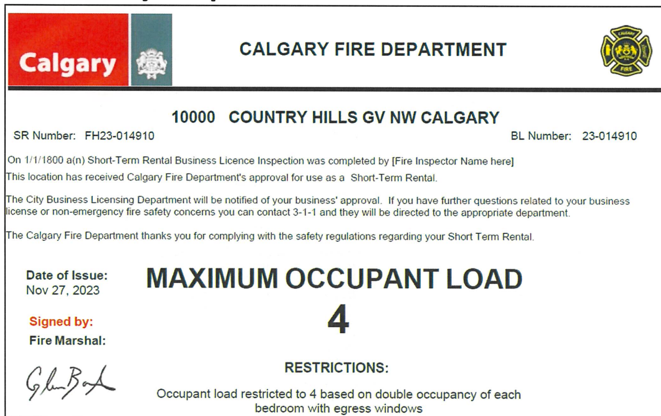
Figure 2 Sample Occupant Load Card (Issued after passing fire inspection)