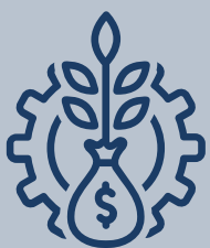
Continued Operations & Financial Sustainability

"Helped retain essential daily operations, adapt operations to be hybrid and prepare to reopen when the pandemic situation gets better and continue to serve the community."