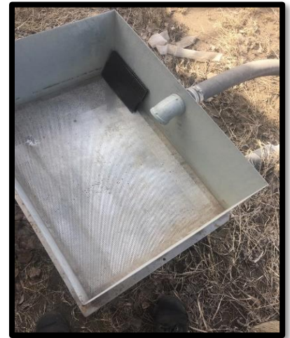
Stormwater Screening System