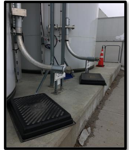
Resin Holding Tanks

For more information please contact 311 or the Industrial Monitoring Group at img@calgary.ca