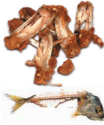
Meat, fish and bones