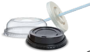
Drink lids Even if it has a recycling symbol.