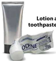
Lotion and toothpaste tubes