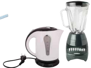
Small broken appliances