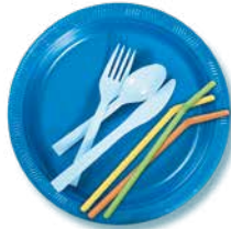
Plastic plates, cutlery and straws