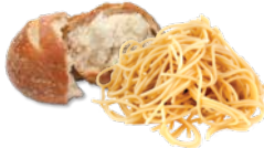
Bread and noodles