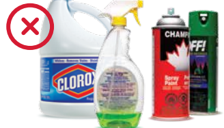
No household hazardous waste

If an item has a hazard symbol, then it must be taken to a Household Hazardous Waste Drop-off, even if it's empty. Find locations at calgary.ca/hhw