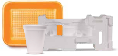
Foam containers or foam packaging Even if it has a recycling symbol.