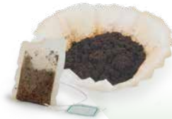
Coffee filters and tea bags