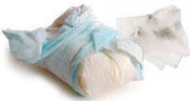
Used diapers and wipes