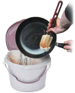
Cooking oil, sauces and grease

Tip: Use a paper towel to soak up any fats, oils or grease and put it in the compost bin.