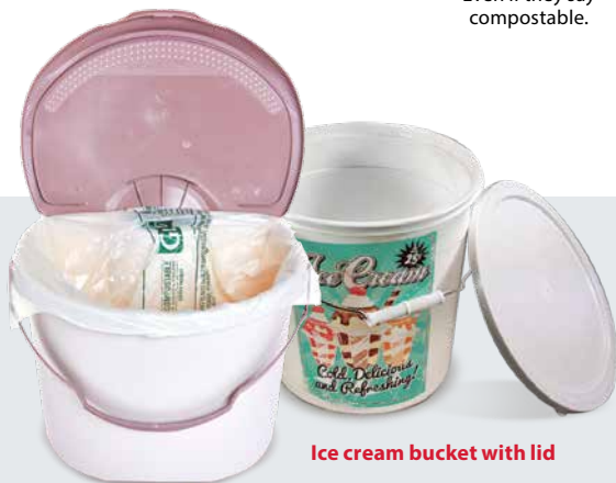
Ice cream bucket with lid