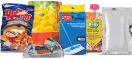
Mixed packaging and non-stretchy bags Even if it has a recycling symbol.

Yes. Put these items in our garbage bin.