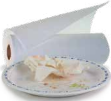
Food soiled paper