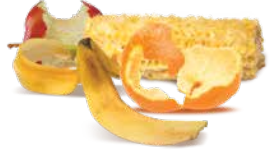
Fruits and vegetables Remove any stickers.