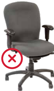
No large or bulky items (e.g. chairs, mattresses, tables).

For recycling drop-off locations visit calgary.ca/whatgoeswhere