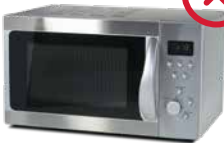
No large electronics or appliances

No. Keep these items OUT of our garbage bin.